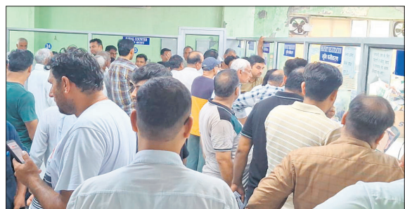
Peope wait for their turn in long queues at the e-Disha Centre in Sirsa.