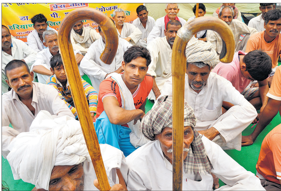
The Mirchpur riot victims had sought ₹1 crore in case of death and ₹25 lakh for injuries.

found the claim to be “incorrect”. Referring to a status report filed by the Special Secretary, Home Department, it said only 33 families had migrated from Mirchpur following the April 2010 violence and had subsequently