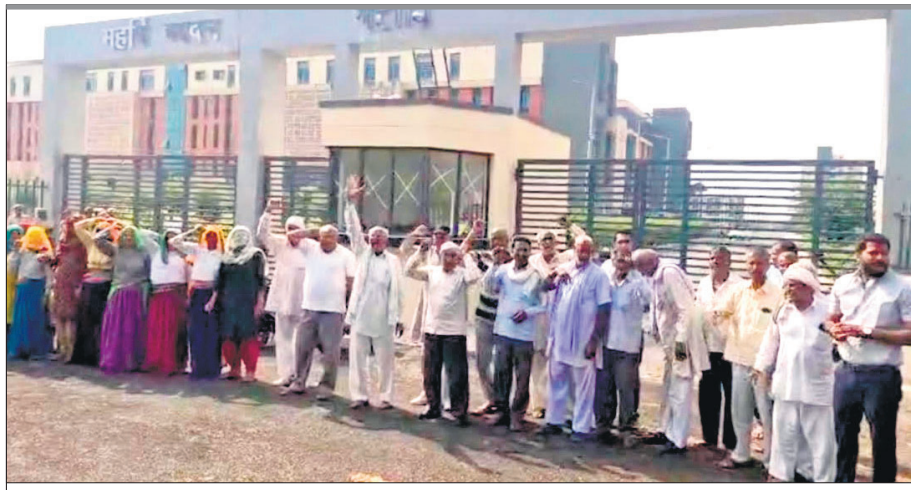
Koriawas residents want Maharishi Chyawan Government Medical College named after Rao Tula Ram.